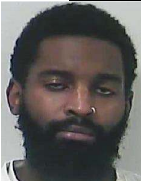
Date of Photograph: January 4, 2017